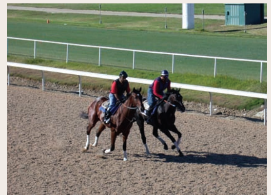
Morning workouts on Hollywood Park's new Cushion Track.